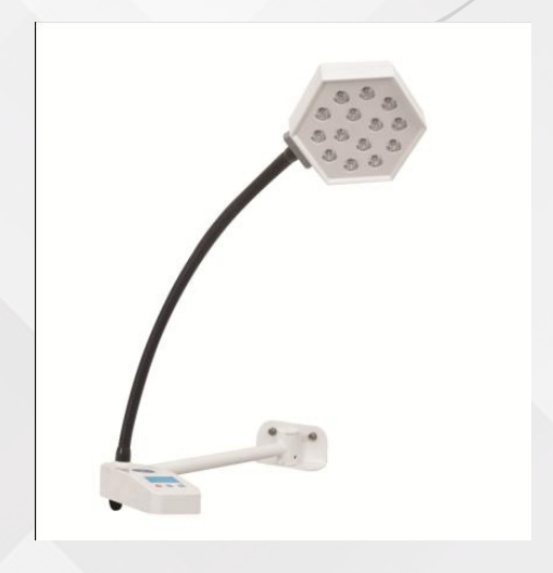
Wall Mounted with Extended Rod